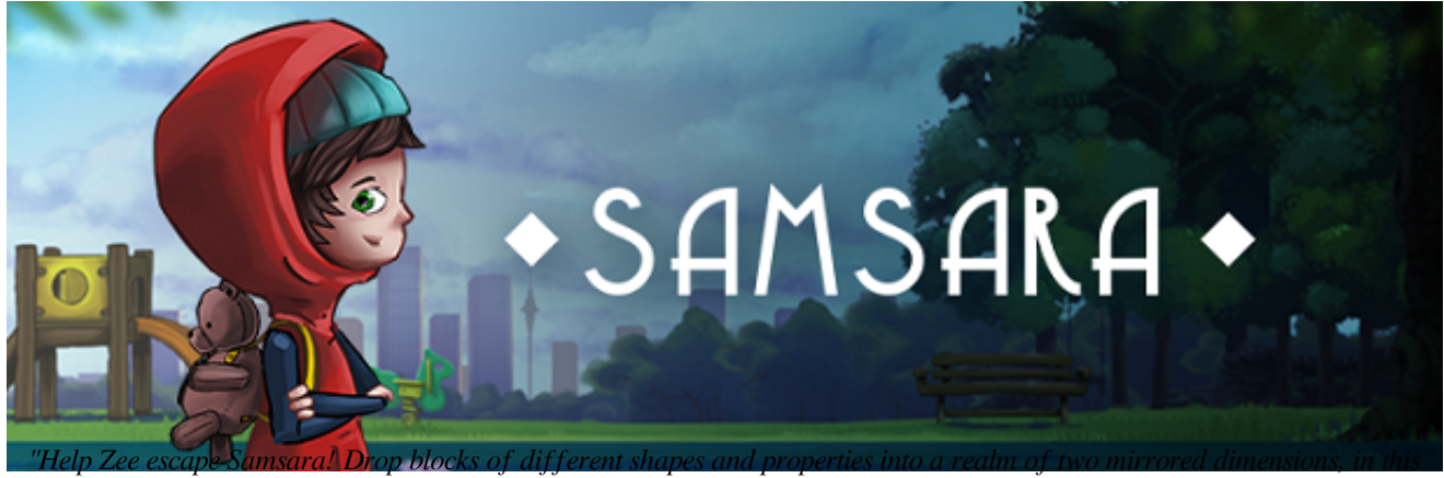
beautiful, reflective puzzle game with a twist ... "

While playing in the park, Zee follows a squirrel through a portal to a world of echoes, inhabited by a shadow child. Surrounded by the unknown and trapped in a series of realms both confusing and dangerous, the youngsters must avoid slipping into the pool between dimensions, embarking on a voyage of discovery and awakening they share with the player, up and down staircases, through light and dark, across the upside-down and the right side-up to their eventual freedom.